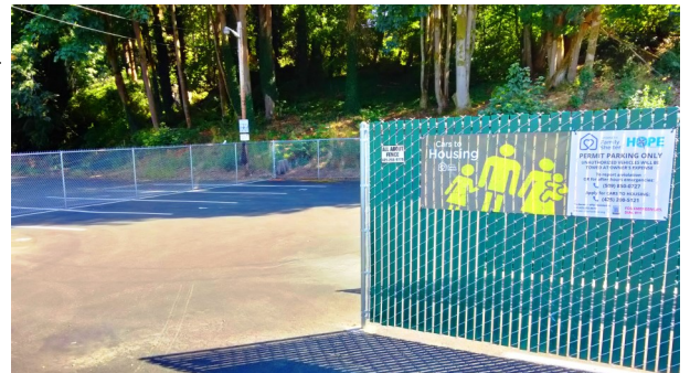
The new C2H site at Hope Covenant Church