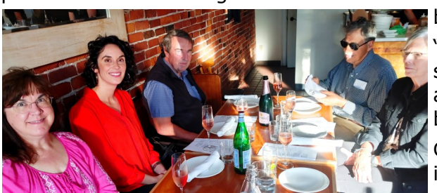
Committee members gathered to toast the Capital Campaign's success in late October.