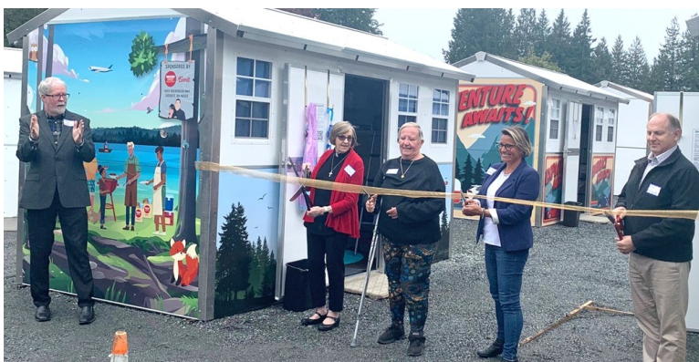
The Faith Family village ribbon cutting on October 11, 2023