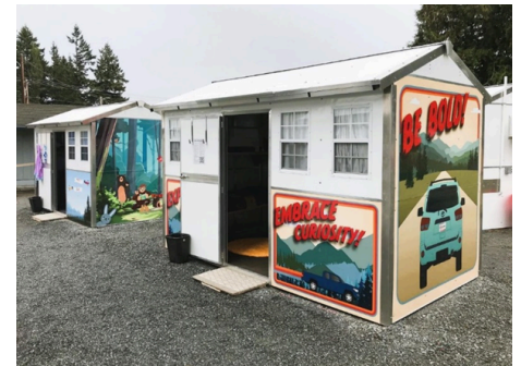
Madison Family Shelter A tiny-home community of 8 family shelter units

Launched in 2024, Madison Family Shelter is an innovative program that extends the cost-effective tiny-home concept to provide eight family shelter units at a single site. Operated in partnership with the City of Everett and Faith Lutheran Church (Everett), this program is an extension of our proven and successful emergency shelter and rehousing program for families with children.